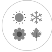
All Season Use