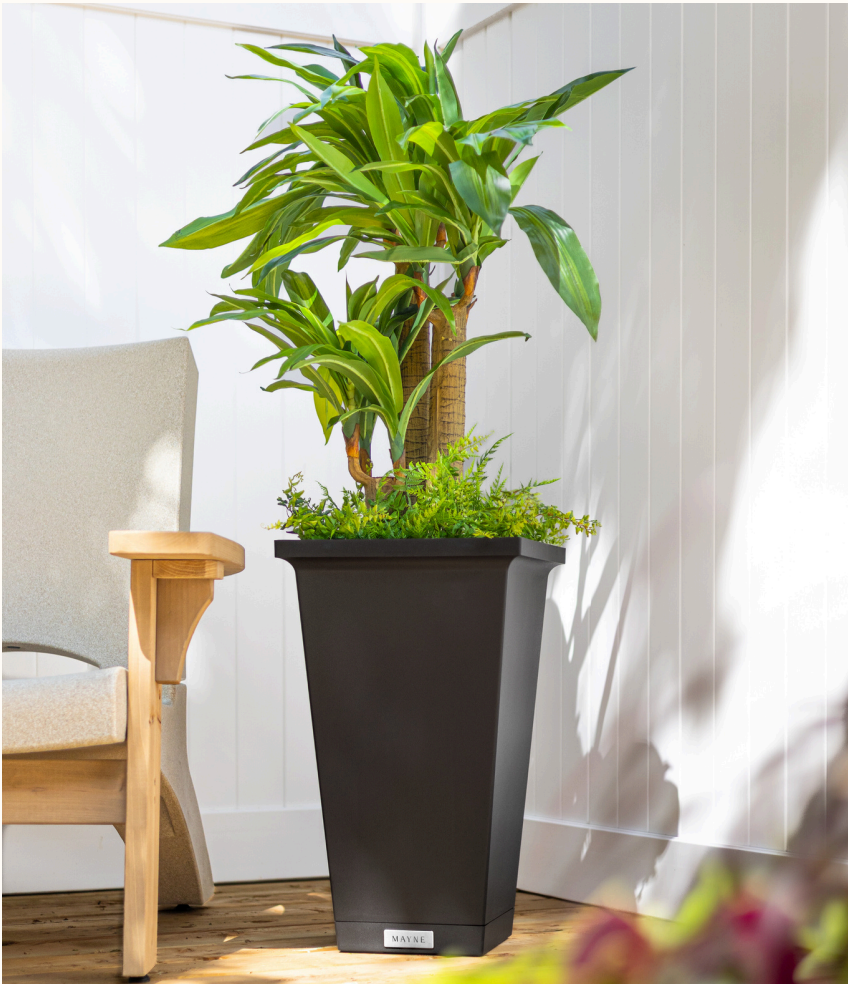
Evolve 24" Tall Planter