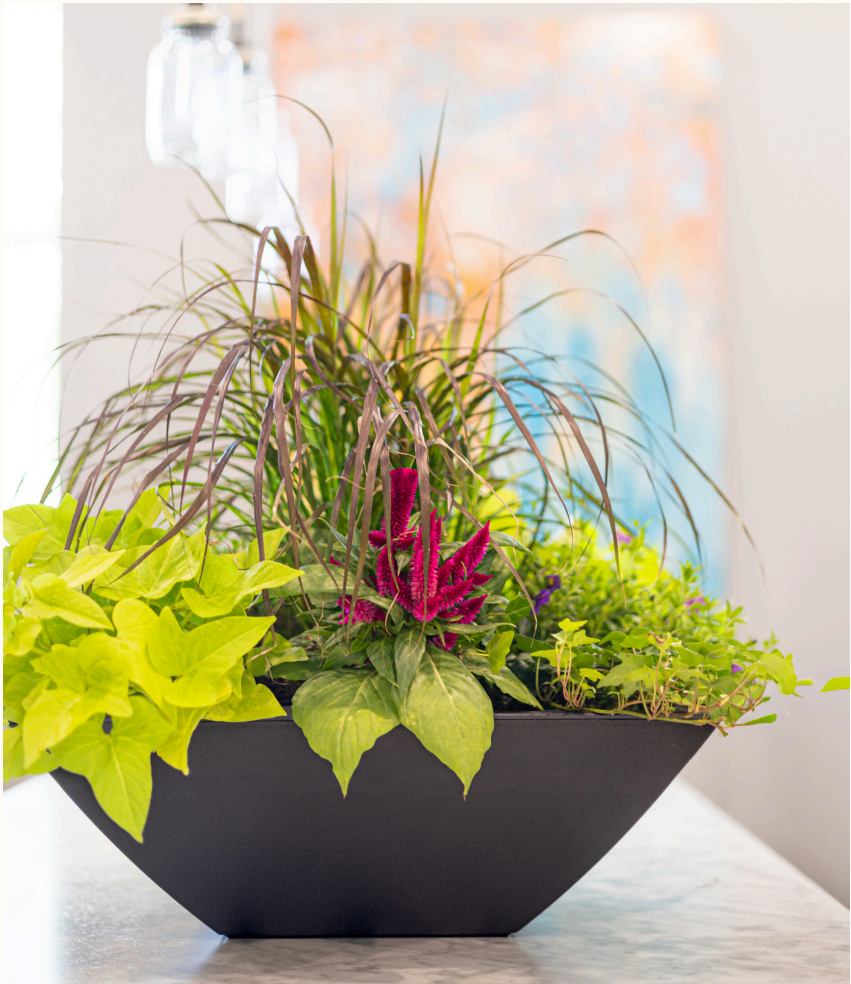
Evolve Square Bowl Planter

Dimensions: 14.5" x 14.5" x 24" Product Weight: 7 lbs. Soil Capacity: 24 Gal Included: Planting Shelf Drip Tray